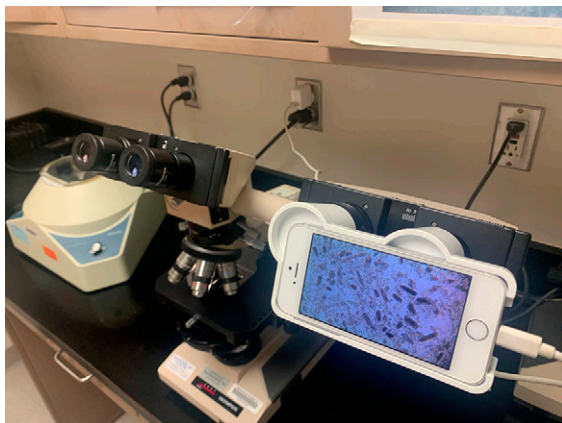
Figure 1. | Centrifuge and microscope with mobile device and adapter.

After survey completion, voluntary urine microscopy teaching sessions were scheduled every month for all internal medicine residents after discussion with residency program leadership. Sessions were held via video conferencing software (Zoom Video Communications, San Jose, CA). A mobile device (iPhone 5C; Apple Inc., Cupertino, CA), installed with the Zoom application, was connected to an Olympus BH-2 microscope via microscope adapter (iDu Optics) (Figure 1). This device was then connected via lightning cable to a computer to share the microscope view with all participants (Figure 2). Fresh urine samples were collected from hospitalized patients shortly before the session, and urine sediment slides were prepared prior to the session using standard technique. Sessions were structured first with a 15-minute introduction to urine microscopy and then, 45 minutes of real-time viewing of the urine sediment with teaching of urine microscopy findings with clinical